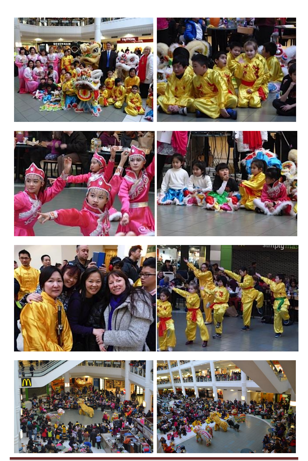
Chinese Association of Woking is a registered Charity (No.1109595). Company Limited by Guarantee, registered in England (No.5132321)